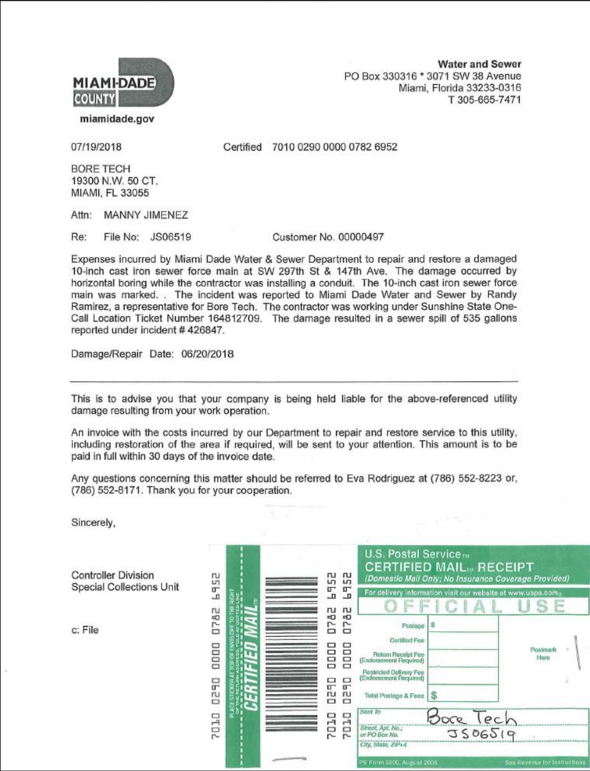
Figure 1 - Notice letter to contractor